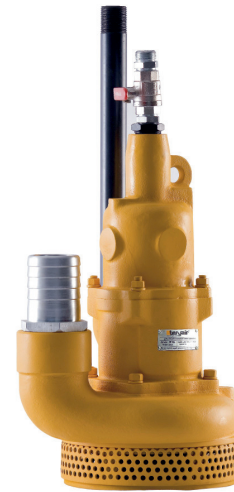
Model : SP 25