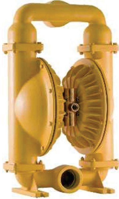
Model No.: DPB75ALN