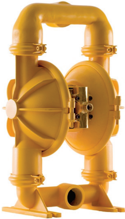
Model No.: DP50ALN