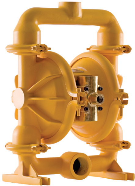
Model No.: DP40ALN