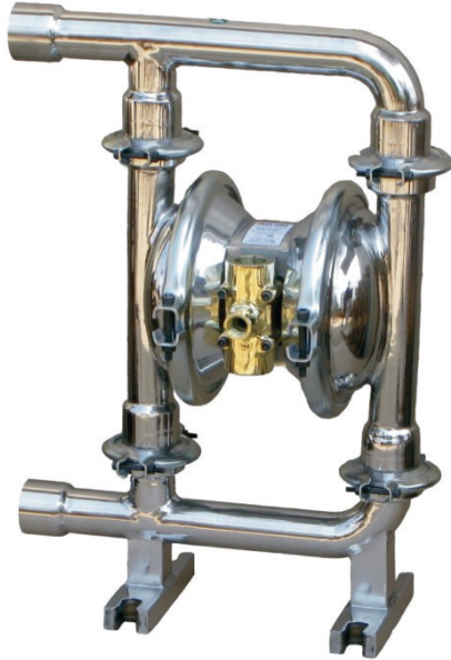
Model No.: DP25SST