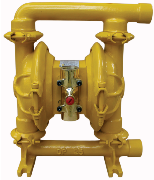
Model No.: DP25ALN